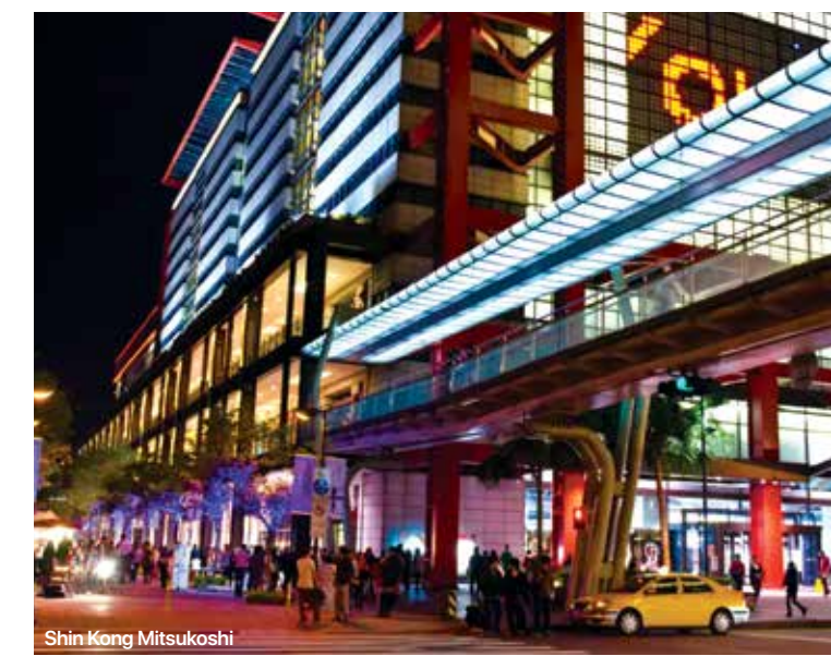
Shin Kong Mitsukoshi

TAIPEI: Ningxia , Ningxia Road, Taipei 103, Taiwan; Raohe , Raohe Street, Taipei 105, Taiwan; Shilin , Zhongshan North Road, Taipei 111, Taiwan TAICHUNG: Fengjia , Wenhua Road, Taichung City 407, Taiwan KAOSIUNG: Ruifeng , Yucheng Road, Kaohsiung City 804, Taiwan