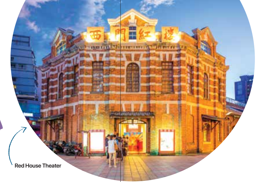
Red House Theater

Spread over a huge underground network, this is often the first stop for tourists who arrive in Taipei. But