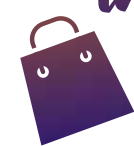
Huashan 1914 Creative Park

Make some shopping bargains in Taiwan's impressive malls with hundreds of outlets or visit day-time markets and late-night bazaars. Taiwan shopping defies definition.