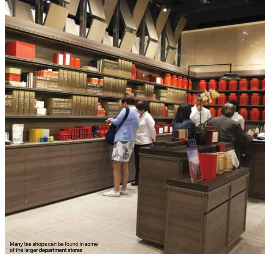
Many tea shops can be found in some of the larger department stores

Where you can buy: Ah Ming Shi Sun Cake Shop, No. 11, Section 2, Ziyou Road, Taichung City 400, Taiwan